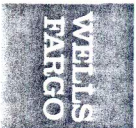
TABLE OF CONTENTS FOR THE PERIOD FEBRUARY 1, 2015 THROUGH FEBRUARY 28, 2015

FRONTIER ACADEMY CECFA 2006 INT FD ACCOUNT NUMBER