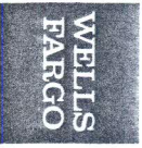
TABLE OF CONTENTS FOR THE PERIOD JANUARY 1, 2015 THROUGH JANUARY 31, 2015

FRONTIER ACADEMY CFCFA 2006 INT FD ACCOUNT NUMBER