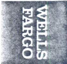
TABLE OF CONTENTS FOR THE PERIOD OCTOBER 1, 2014 THROUGH OCTOBER 31, 2014

FRONTIER ACADEMY FTFA 2006 INT FD ACCOUNT NUMBER